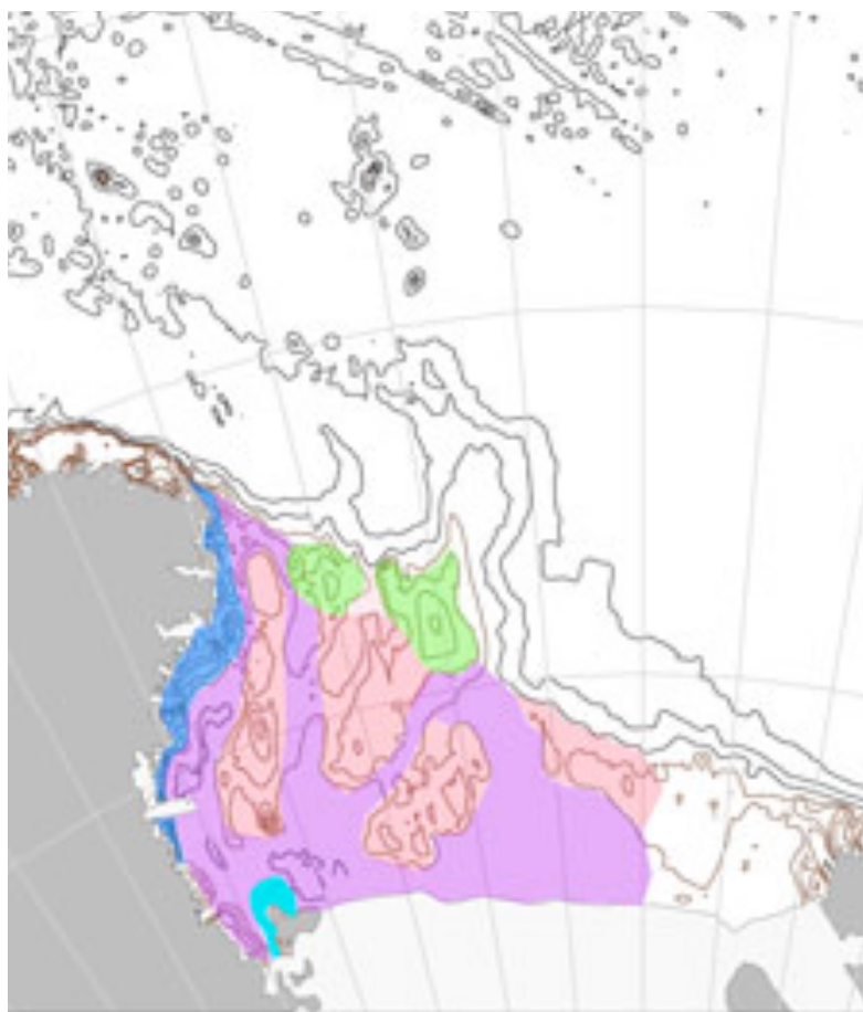
Figure 1. Distribution of Ross Sea benthic communities; green, Pennell Bank; pink, deep shelf mixed; purple, deep shelf mud; blue, Victoria Land coastal; aquamarine, McMurdo Sound. Data from Bullivant (1967) and Barry et al. (2003).